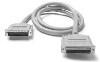
Standard Dsub cable